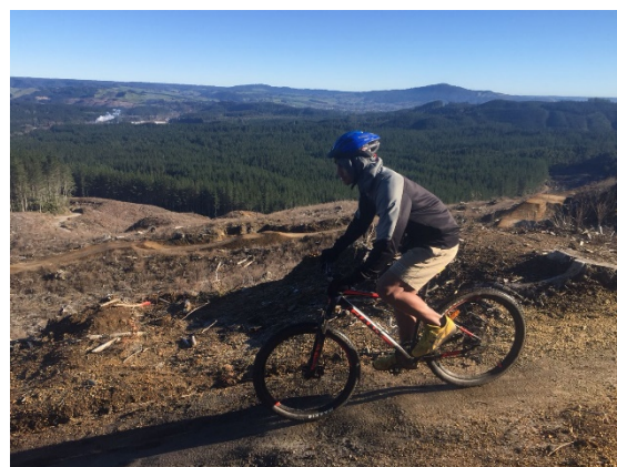
3 days mountain biking in Taupo and Rotorua. Everyone was sore. With Outdoor Education class.