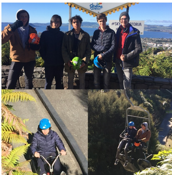
Luging in Rotorua: term 2 activity 2. A boys day out!