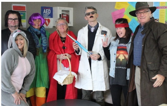
Teachers are heavily involved as well.