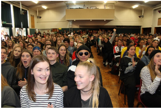
The rest of the school is a great audience