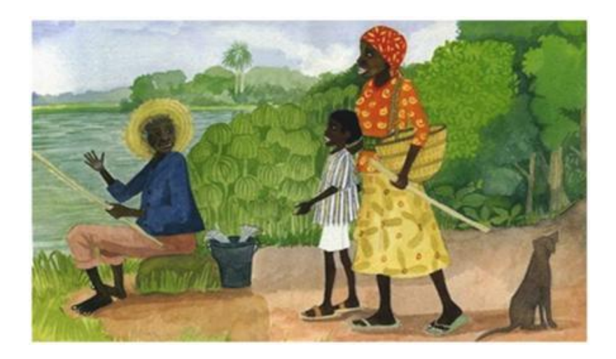
Mama Panya's Pancakes

Mama Panya sang as she kicked sand with her bare feet, dousing the breakfast fire.